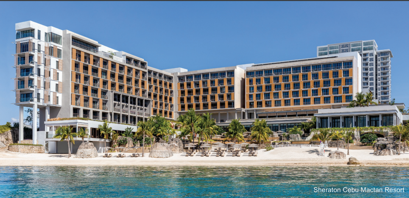
Sheraton Cebu-Mactan Resort